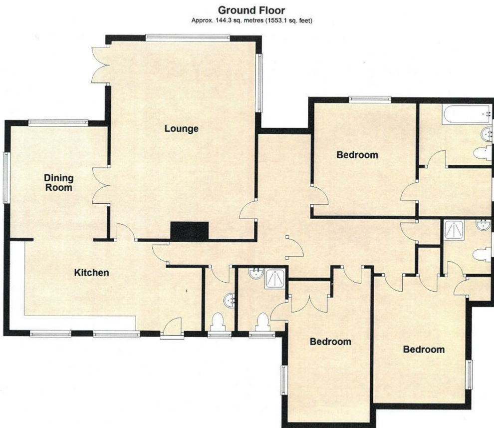
Total area: approx. 144.3 sq. metres (1553.1 sq. feet) Artists impression. for illustration purposes only. All measurements are approximate. Not to Scale.