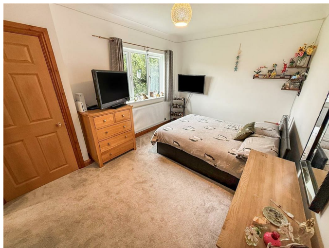
Bedroom Two 16'6" x 8'9" (5.03m x 2.67m)

The second double bedroom has a window to the side, two built in cupboards, radiator and a door leading to the second en-suite.