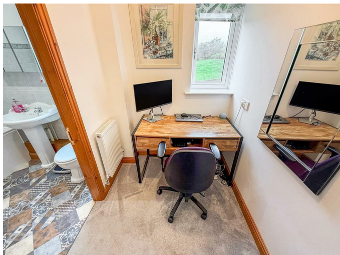
Dressing Room 5'0" x 4'10" (1.54m x 1.48m)

Having a window to the side, radiator and lighting. A door leads through to the en suite bathroom. Coved ceiling.