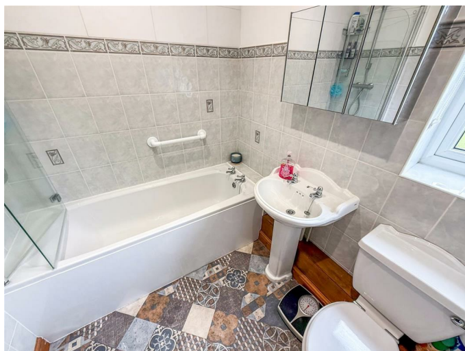
En-Suite 6'5" x 10'5" (1.96m x 3.20m )

Having a paneled bath with glass screen and mains powered shower, low level W/C, wash hand basin, part tiled walls, spotlighting and a window to the side. Vinyl flooring, extractor fan and radiator.